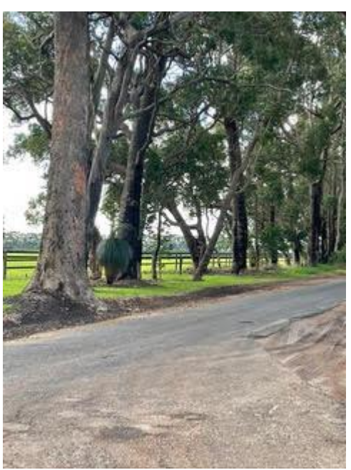
Old growth marri could be protected by guard rail