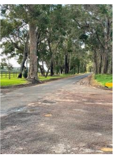
Lower speed environment on approaches to intersection to improve safety