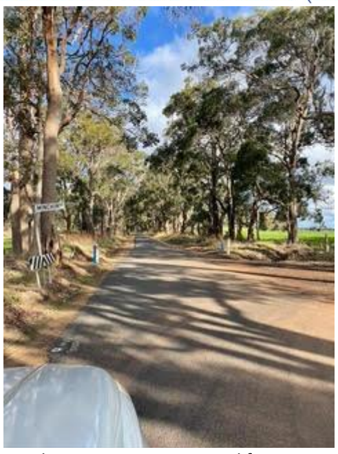
Road intersection. Note road formation available from existing road surface to guide post compared to photo on left.