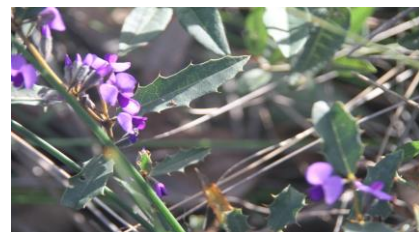
Hovea chorizmifolia .