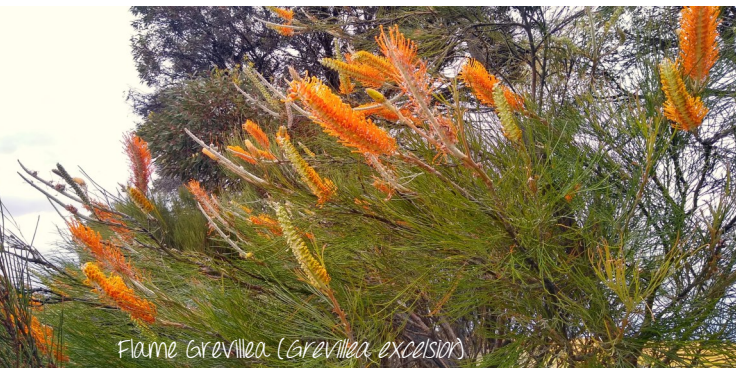
Flame Grevillea ( Grevillea excelsior )