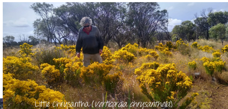
Little Chrysanthra ( Verticordia chrysanthella )