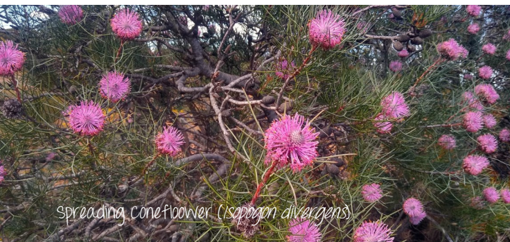
Spreading Coneflower ( Isopogon divergens )