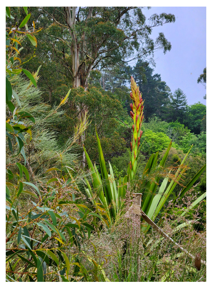
Above: Doryanthus palmeri at the Chelsea Garden at Olinda.

There are some real show stoppers – the Grevillea excelsiors were spectacular and are thriving. They are planted in many places in the garden.