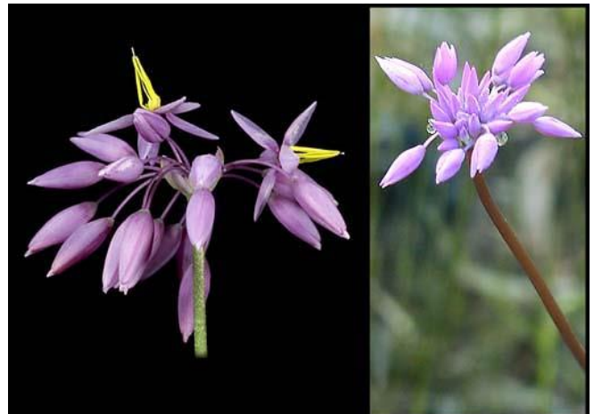
Sowerbaea laxiflora